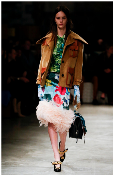
Fall 2017 Womenswear

Prada is a proponent of the good taste of bad taste transforming the unconventional into art and proving that fashion can be subjective, embracing both beauty and the unexpected.