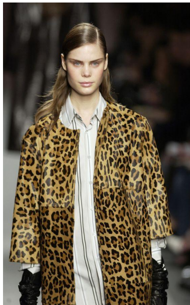
Fall 2003 Womenswear

Prada often combines patterns and prints that typically wouldn't be matched, creating striking looks that may clash yet result in visually captivating outfits.