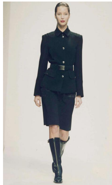
Fall/Winter 1994 Womenswear

Prada blends sharp masculine tailoring with delicate feminine accents, creating a bold yet elegant looks.